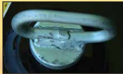
Quick Hitch Pin