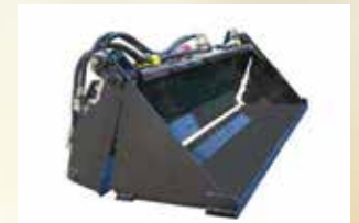
4 In 1 Bucket