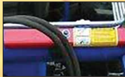
Cylinder Lockin Plate