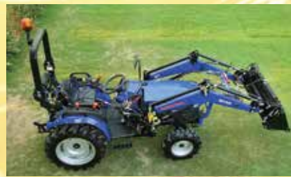
Chassis Based Design